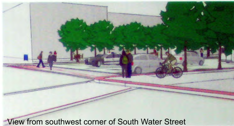
View from southwest corner of South Water Street